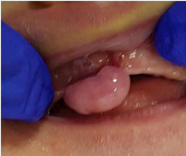
Figure 1. Congenital granular cell tumor in the anterior-superior maxillary alveolar ridge, region of the upper right temporal incisors, with an approximate size of 15-mm in length, in a newborn female patient.

The patient was classified as Asa I and her blood count was normal.