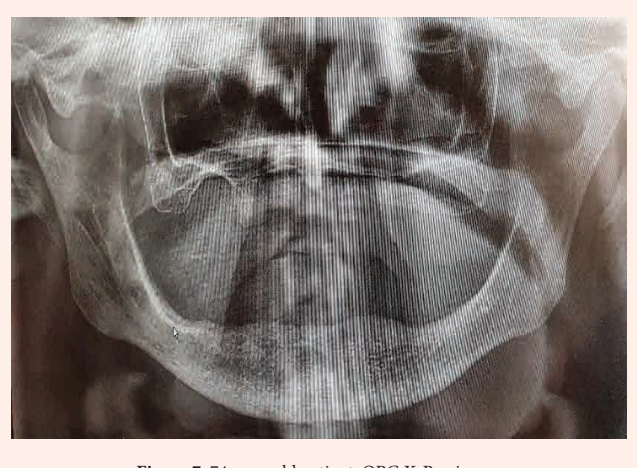
Figure 7: 74-year-old patient, OPG X-Ray image.