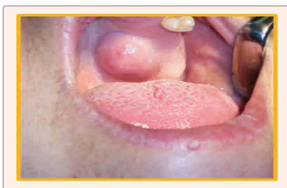
Figure 1: 35-year-old patient, local finding in oral cavity.

In our work, we present two cases of pleomorphic adenoma of small salivary glands. The first case is a 35-year-old patient with a formation on the left side of the hard palate. The patient observes this formation for about 6 months (Figure 1). The solid consistency was without fluctuation, did not bleed or hurt. The formation has grown in the last 2 months. The formation was extirpated and the defect was covered with a rotating lobe. The material was sent for histological examination (Figures 2-5). The second case is a 74-year-old patient who has had a rigid formation in the oral cavity for about 20 years. The size of the formation limits her quality of life (Figure 6). All teeth were extracted in the jaw, she never wore a total replacement. The formation is placed on the right side of the mucosa of the mxilla's alveolar ridge. It is large. Changes in terms of oppressive resorption are visible on OPG X-ray (Figure 7). In both cases, radical surgical treatment with histologization was performed.